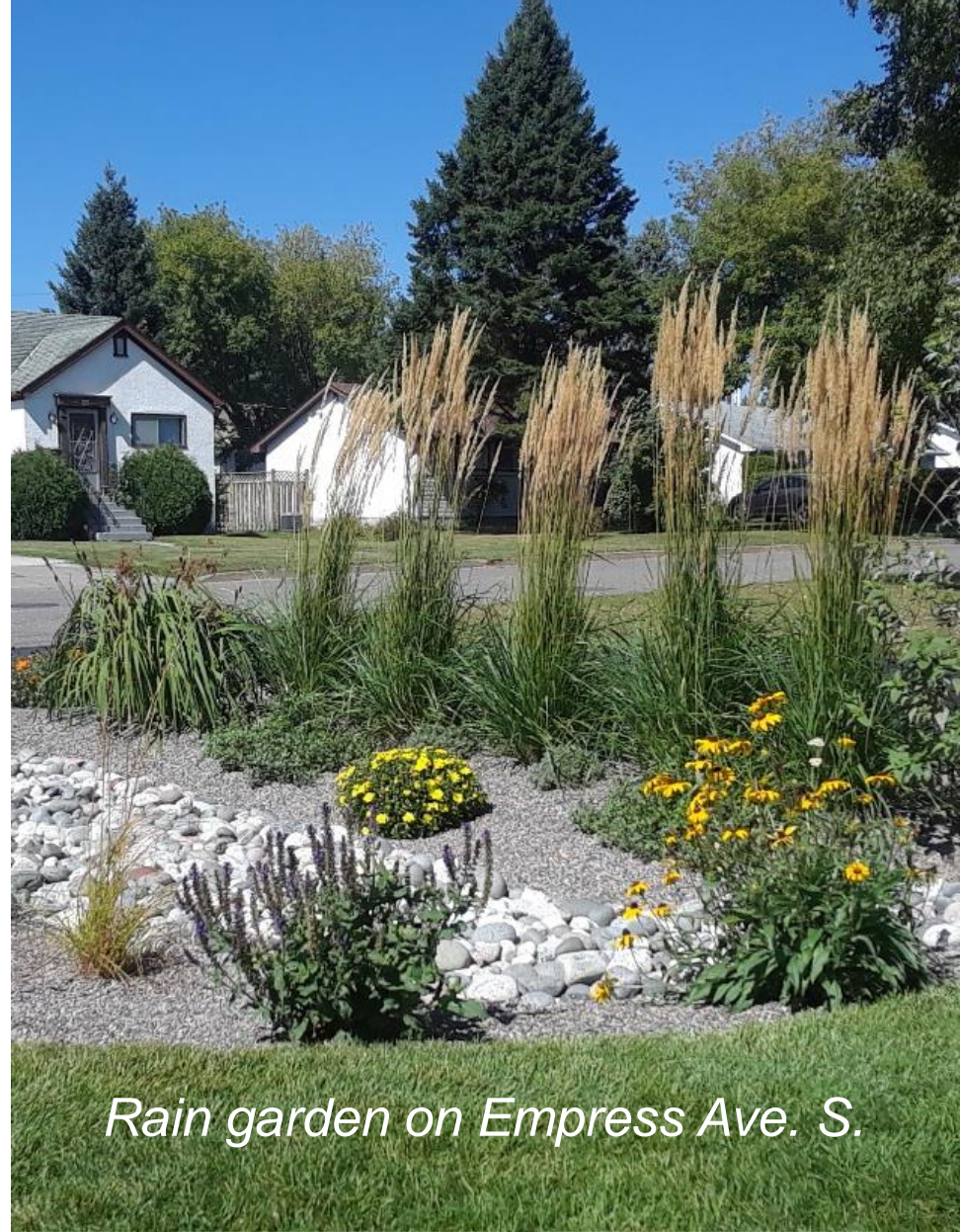
Rain garden on Empress Ave. S.