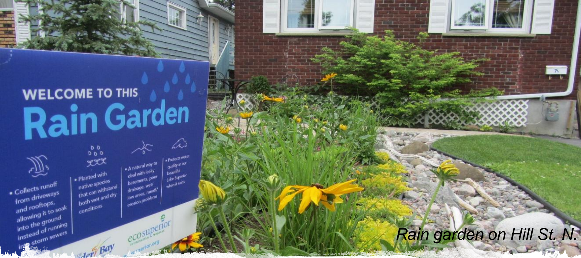
Rain garden on Hill St. N.